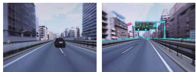
Figure 3. Synthesized rendering result